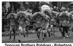
Donovan Brothers Potatoes - Robertson

Ground Admittance Adults $12.00, Children $6.00, Pensioners $7.00, Cars $50.00, Exhibitors by pass Gates open 6.30 am