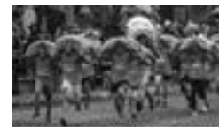
Doherty Brothers Potatoes - Robertson

Ground Admittance Adults $12.00, Children $6.00, Pensioners $7.00, Cars $50.00, Exhibitors by pass Dog gates open at 6.30 am