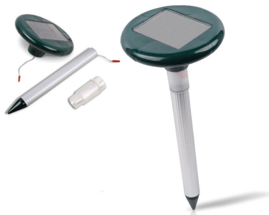
Above: Typical garden snake repellent Left page: Eastern Brown Snake Below left: Red-bellied Black Snake Below: Tiger Snake

If you live in an area with a reasonable incidence of snake sightings, it is well worth getting a book on the subject so that you can learn to distinguish between the various types.