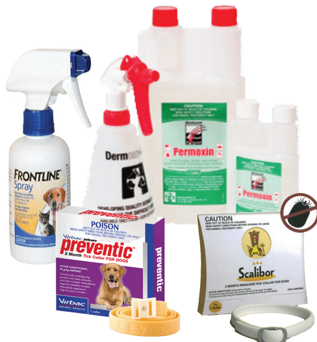
Above: A number of available preventative tick treatments and collars

If travelling into known tick areas (as many people go to the beach areas with their dogs during the school holidays), pre-treat the dogs with Frontline ® or Advantix ® 1 week prior to going and ideally put a tick collar on as well. Check the dog daily while there and again for 4-8 days after returning home.